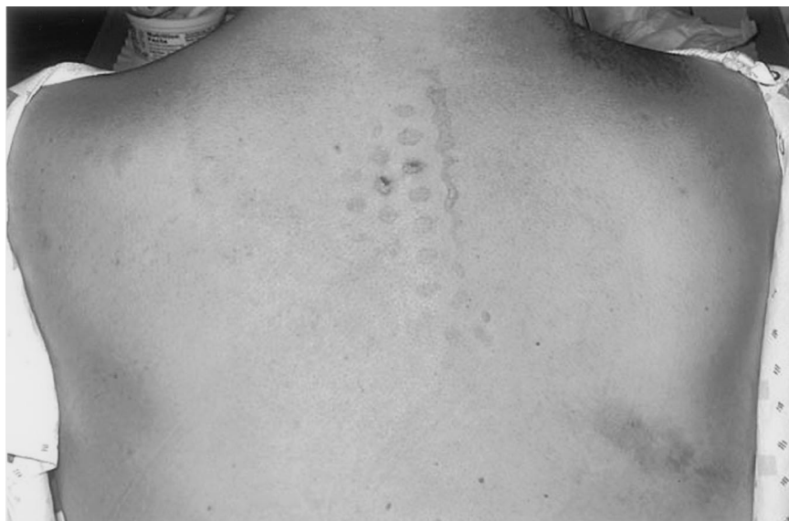
Fig. 2. Photograph showing mid-upper thorax skin injury.

temperature regulation. The ThermoWrap blanket is filled with water; temperature is regulated via a micro-processor that receives feedback from up to three temperature sensors. The sensors can be utilized to measure rectal, esophageal, and skin temperatures. Feedback from the sensors adjusts the temperature of the water circulating through the garment.