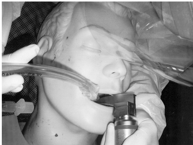
Fig. 1. The bottom edge of the full-face shield is almost pressing on the "patient's" eyes.

Supported was provided solely from institutional and/or departmental sources.