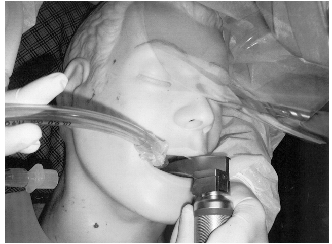
Fig. 1. The bottom edge of the full-face shield is almost pressing on the "patient's" eyes.

Supported was provided solely from institutional and/or departmental sources.