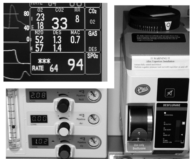
Fig. 1. Anesthesia machine settings during the event described. Inset shows contemporaneous gas analyzer readings. The difference was due to room air entrained through a large hole in the breathing bag.

(Accepted for publication September 18, 2003.)