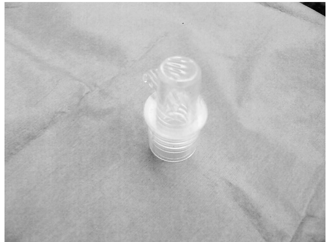
Fig. 1. Straight gas sampling connector (SIMS Portex) with plastic packaging forming an obstructive membrane.

After numerous failed attempts to acquire a Reply to this Letter, it is being published without a response. —Michael M. Todd, Editor-in-Chief.