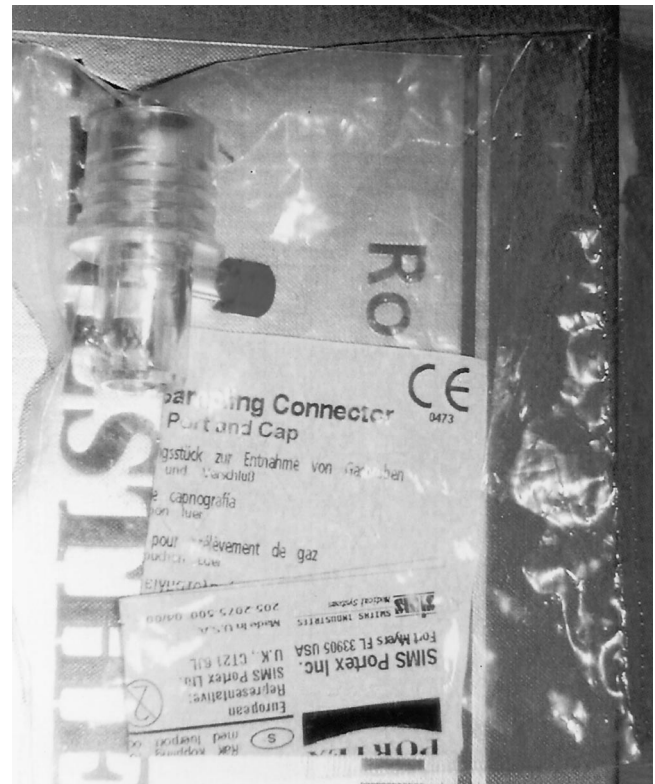
Fig. 2. Straight gas sampling connector (SIMS Portex) in its original plastic packaging.