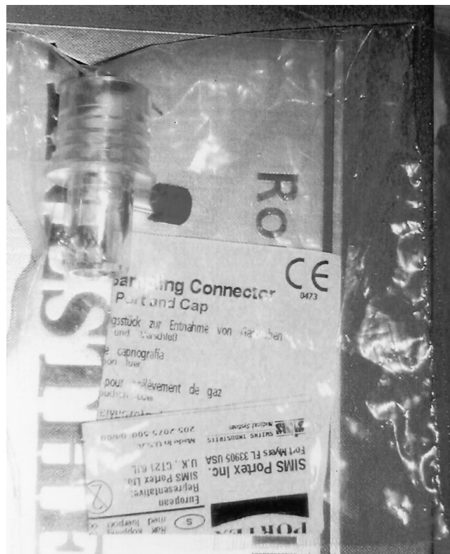
Fig. 2. Straight gas sampling connector (SIMS Portex) in its original plastic packaging.