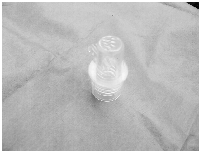
Fig. 1. Straight gas sampling connector (SIMS Portex) with plastic packaging forming an obstructive membrane.

After numerous failed attempts to acquire a Reply to this Letter, it is being published without a response. —Michael M. Todd, Editor-in-Chief.