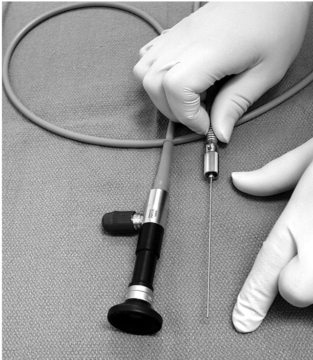
Fig. 1. A miniendoscope (Karl Storz Endoscopy), which is 1.2 mm in OD and 10 cm in length. The telescope has a 0° direction (straight-forward looking) and a 70° angular sector of visualization. It is connected to a light source and an eyepiece.

In eight dogs, a cricothyrotomy kit (Melker Emergency Cricothyrotomy Catheter Set; Cook Critical Care, Bloomington, IN) was used. In this technique, a wire guide is passed through an intratracheal catheter, the catheter is removed, and an enlarging scalpel incision is made. A tapered 12-French dilator is placed in a curved 4-mm-ID cannula and is advanced over the guide wire. The dilator and guide wire are removed, and the curved cannula is left in place.