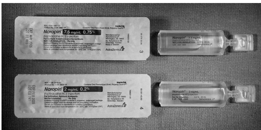
Fig. 1. Illustration of two concentrations of ropivacaine. Note the nearly identical appearance of both the ampule and package of each concentration.

(Accepted for publication April 18, 2004.)