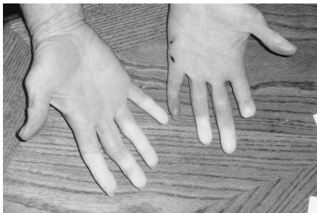
Fig. 1. Photograph of patient's hands preoperatively.

Subsequent to this surgery, she has decreased her oral analgesic medications and continues to be active.