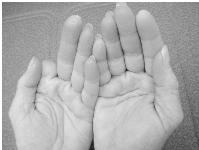
Fig. 3. Photograph of patient's hands 5 months postoperatively.