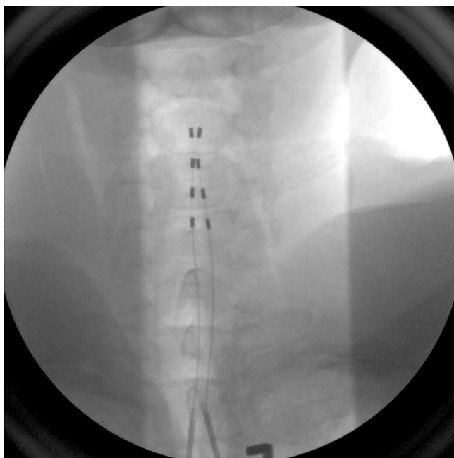
Fig. 2. Cervical spinal cord stimulator electrode placement.

Spinal cord stimulator settings from her most recent reprogramming session are available for review in the Appendix.