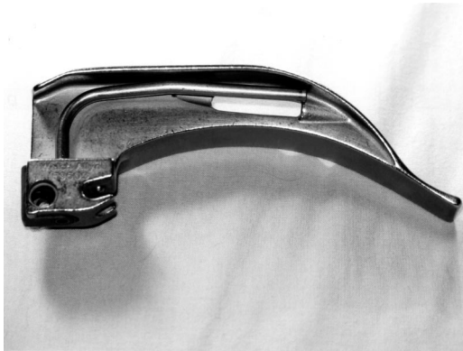
Fig. 1. Misassembled laryngoscopic blade.

Closer examination of the blade revealed a misassembled laryngoscope blade with the fiberoptic light source on the outside of the blade (fig. 1) instead of its correct position (fig. 2). Another laryngoscope was used at this point, and intubation was performed easily, revealing normal anatomy.