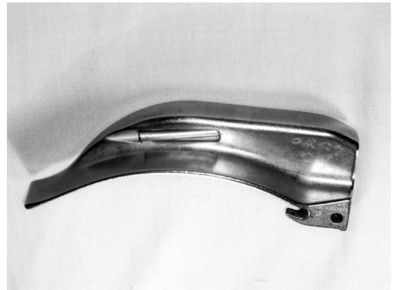
Fig. 2. Normal laryngoscopic blade.

The fiberoptic component of this type of laryngoscope blade is removable for cleaning or can spontaneously come loose. Care should be taken during its reassembly.