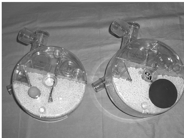
Fig. 2. The disposable absorber with a corked hole made by us on the left side and a reusable absorber with a rubber stopper from the manufacturer on the right side.

prove our point. During the past two decades, multiple groups have participated in humanitarian medical missions throughout the world. It stands to reason that variations on the theme we describe must have been used by others, but there are no published reports to the effect. We very much hope that our report will be of help to a new group about to undertake a medical mission to an underdeveloped area. This system might also be useful in emergency conditions in the field or for makeshift operating rooms. We recommend this system for the administration of anesthesia in remote areas and developing countries or anywhere where a functioning anesthesia machine is not available.