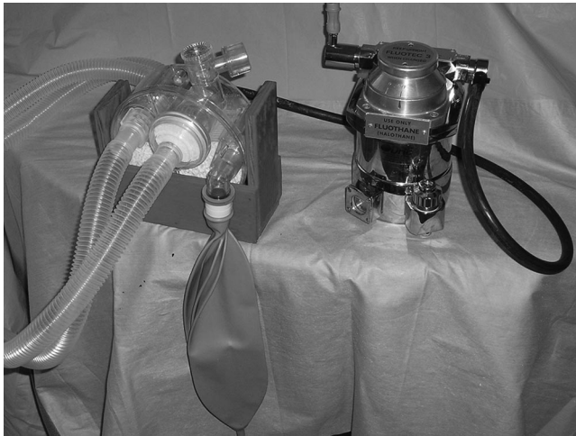
Fig. 1. Anesthesia circuit (oxygen tank not in the picture).

self-sufficient system with which all team members would be familiar and comfortable. Over time, our efforts have evolved into a sophisticated but low-technology approach to the problem of delivering safe anesthesia without a modern anesthesia machine.