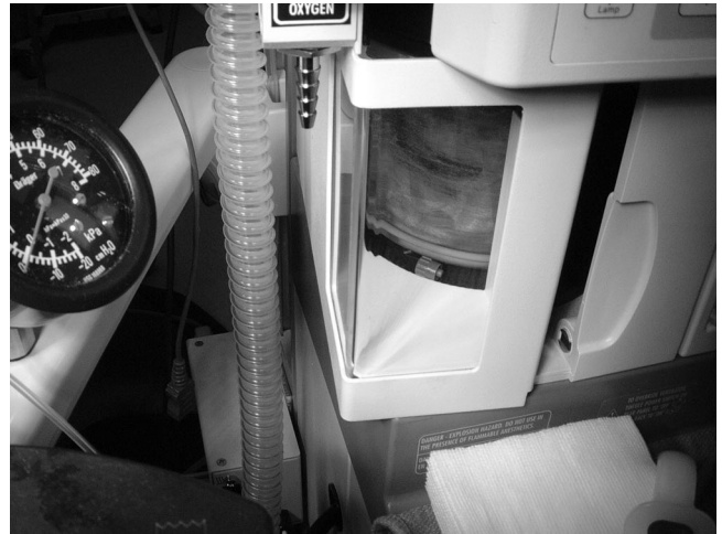
Fig. 1. Plastic cap under the mechanical ventilator piston.

Small objects, particularly plastic caps, are ubiquitous in the operating room. The upper shelf edge in the Draeger Fabius GS lies just above