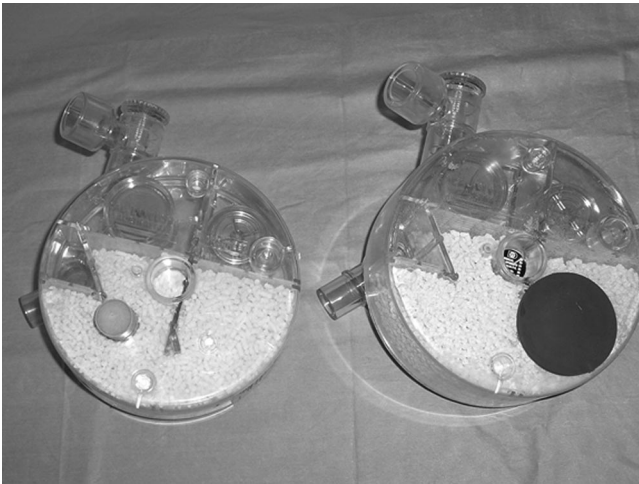
Fig. 2. The disposable absorber with a corked hole made by us on the left side and a reusable absorber with a rubber stopper from the manufacturer on the right side.

prove our point. During the past two decades, multiple groups have participated in humanitarian medical missions throughout the world. It stands to reason that variations on the theme we describe must have been used by others, but there are no published reports to the effect. We very much hope that our report will be of help to a new group about to undertake a medical mission to an underdeveloped area. This system might also be useful in emergency conditions in the field or for makeshift operating rooms. We recommend this system for the administration of anesthesia in remote areas and developing countries or anywhere where a functioning anesthesia machine is not available.