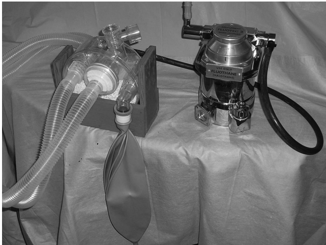
Fig. 1. Anesthesia circuit (oxygen tank not in the picture).

self-sufficient system with which all team members would be familiar and comfortable. Over time, our efforts have evolved into a sophisticated but low-technology approach to the problem of delivering safe anesthesia without a modern anesthesia machine.