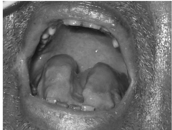
Fig. 1. Aspect of the tongue on postoperative day 10 showing superficial necrosis and medial clefting.

The pathophysiologic mechanisms of the injury include prolonged glossal compression with venous congestion, edema, and ischemia that lead to the tongue necrosis. 2 The main reason for the swelling seems to be a compression of the glossal blood vessels, especially the lingual veins. Other causes include sublingual hematoma 3 and obstruction of the submandibular duct. 4 The position of the patient may also contribute to this problem. Massive tongue edema after spinal surgery has been reported, attributed to the flexed thoracic–cervical position required. 5 Lingual nerve injury has been associated with orotracheal intubation and may contribute to this problem because of sensory deprivation. 6