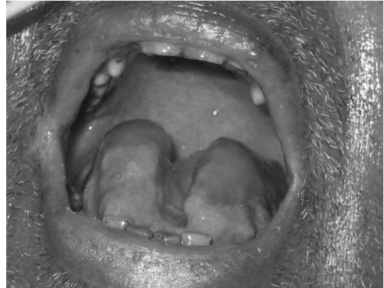
Fig. 1. Aspect of the tongue on postoperative day 10 showing superficial necrosis and medial clefting.

The pathophysiologic mechanisms of the injury include prolonged glossal compression with venous congestion, edema, and ischemia that lead to the tongue necrosis. 2 The main reason for the swelling seems to be a compression of the glossal blood vessels, especially the lingual veins. Other causes include sublingual hematoma 3 and obstruction of the submandibular duct. 4 The position of the patient may also contribute to this problem. Massive tongue edema after spinal surgery has been reported, attributed to the flexed thoracic–cervical position required. 5 Lingual nerve injury has been associated with orotracheal intubation and may contribute to this problem because of sensory deprivation. 6