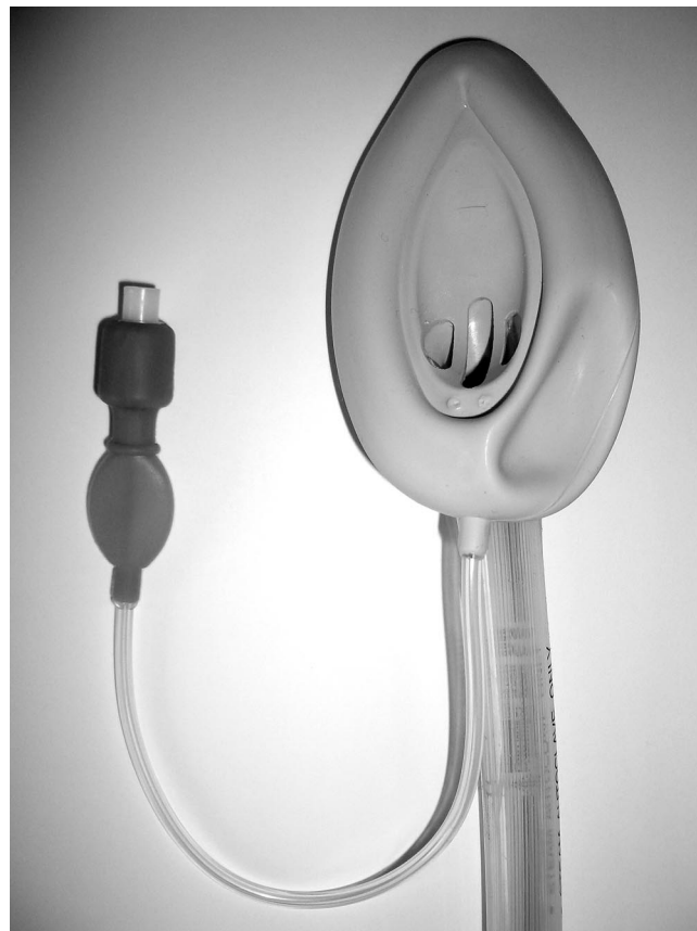
Fig. 2. Laryngeal mask airway with deflated cuff.