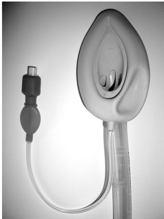
Fig. 2. Laryngeal mask airway with deflated cuff.