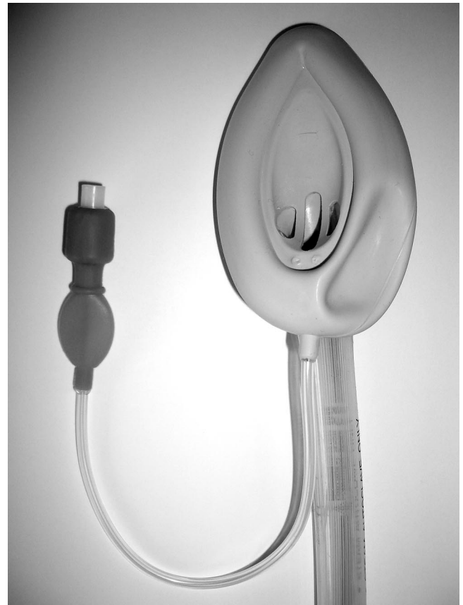
Fig. 2. Laryngeal mask airway with deflated cuff.