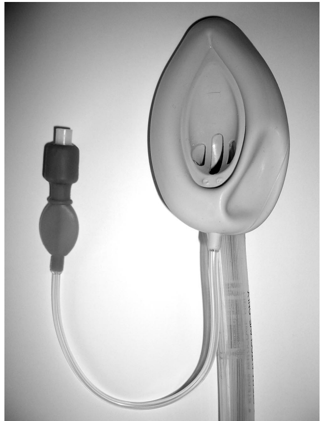
Fig. 2. Laryngeal mask airway with deflated cuff.