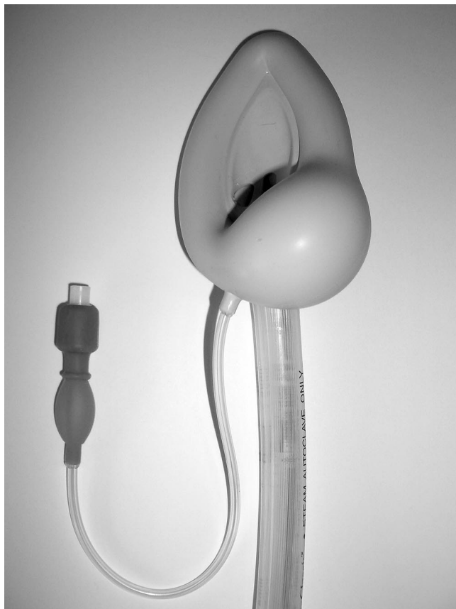
Fig. 1. Laryngeal mask airway with inflated cuff.

Removal of the LMA™ and inspection of the cuff should be considered to rule out this potentially deleterious technical problem.