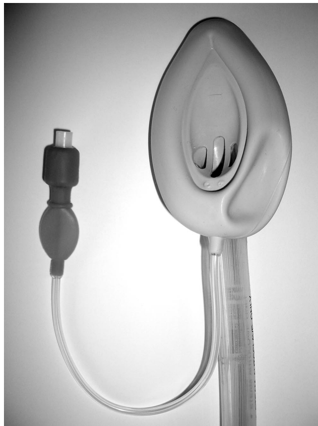
Fig. 2. Laryngeal mask airway with deflated cuff.