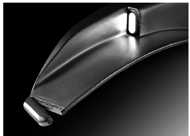
Fig. 1. The loose tip of the laryngoscope blade (partially reattached for illustration purposes) as noticed after cleaning and sterilization.

blade tip are remarkably sharp and rugged. In the case where the tip would still be attached to the blade upon insertion of the laryngoscope blade into the hypopharynx, the small metal tip could be dislodged during