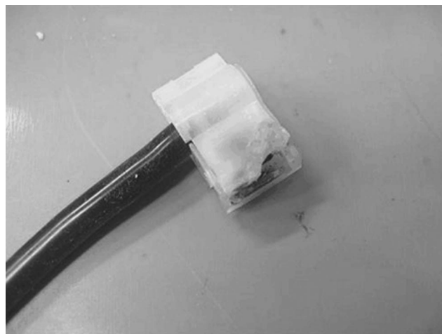
Fig. 3. The eroded cable connector that caused the malconduction trouble.

Support was provided solely from institutional and/or departmental sources.