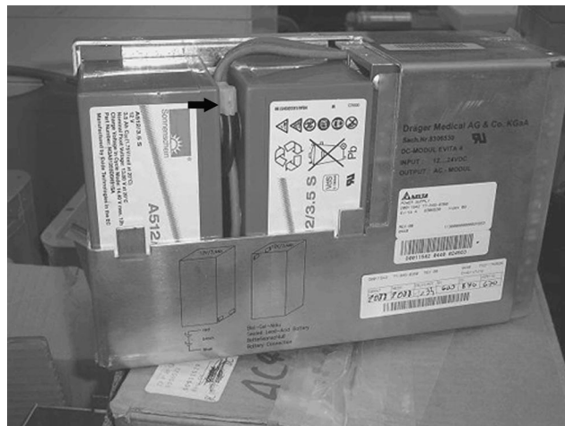
Fig. 2. A pair of the same type of batteries as the failed battery is placed in the adjunct battery assembly of the DC power module. The arrow indicates the cable connector to a battery.