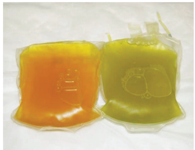
Fig. 1. The green plasma unit on the right , shown with a typical yellow unit.

The yellow color of plasma is due to the presence of the yellow pigments bilirubin, carotenoids, hemoglobin, and iron transferrin. A previous report had noted the green appearance of sera obtained from donors with rheumatoid arthritis and had identified a corresponding decrease in the yellow pigments of these sera, especially in patients with disease duration of more than 10 yr. 4 However, Tovey and Lathe 1 reported hundreds of units of strikingly green plasma subsequently identified to be from a second cohort of donors (young married women) who did not have rheumatoid arthritis and whose sera had normal levels of yellow pigments. They were unsuccessful in extracting a green pigment from the green plasma; however, they found an unexpected blue precipitate. This pigment was subsequently identified as ceruloplasmin. Ceruloplasmin is a normal plasma glycoprotein, \alpha_2 globulin, that functions as a carrier for copper and also acts as an acute phase reactant. 5 The level of ceruloplasmin can be elevated with elevated copper levels, in rheumatoid arthritis, and in high-estrogen states such as pregnancy and oral contraceptive use. 6,7 Tovey and Lathe were able to confirm elevated ceruloplasmin levels in the green plasma units in their study. 1 A subsequent study by Wolf et al. 2 also found high normal or elevated ceruloplasmin levels in 15 donors, all of whom were taking oral contraceptives and all of whom had