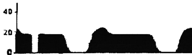
Fig. 5. An example of the capnogram after adding an additional 24 inches (additional 1.5 ml of dead space) of arterial tubing to the original (modified) sample line (6.7-ml total dead space). Note that the original midplateau hump has moved further to the left of the capnogram (longer transit time).

We hypothesized that this triphasic capnogram was a result of increased dyssynchrony between the positive-pressure phase of mechanical ventilation and the arrival of the end-tidal gas at the gas analyzer. During expiration, negative pressure at the crack in the water trap allowed room air to enter the sample, thereby decreasing the carbon dioxide concentration by sample dilution (first plateau). At the initiation of inspiration by the mechanical ventilator, the negative pressure at the cracked water trap is reversed as the piston exerts positive pressure (peak inspiratory pressure), represented by the higher plateau (hump). The higher plateau most accurately represents end-tidal carbon dioxide as sample dilution is eliminated. We hypothesize that the third plateau was due to the increased sample line volume. This increases the dead space and therefore the time between expiration and the arrival of end-tidal carbon dioxide at the analyzer. Assuming a 200 ml/min sample flow rate, a 1.5-ml increase in sample-line dead space could be expected to result in a 0.45-s increase in transit time. Thus, the positive-pressure phase of inspiration shifts to the left (longer transit time) in the capnograph waveform. At the end of the positive-pressure phase of mechanical ventilation, the expiratory carbon dioxide in the sample line is diluted again as a result of the leak in the water trap producing the lower plateau (third plateau).