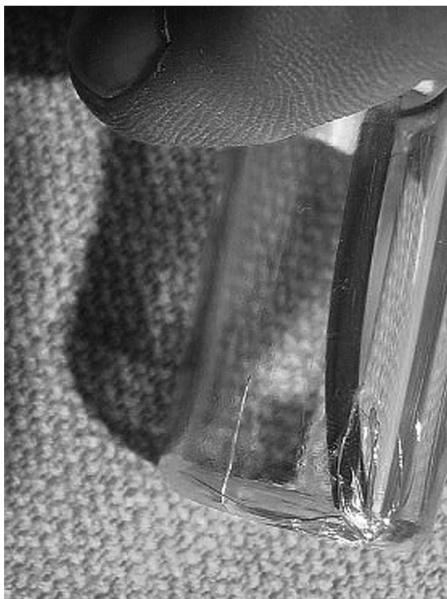
Fig. 3. Cracked water trap.

waveforms have been described 5 and are the result of room air drawn into the sample line, often through a leak or loose connection anywhere between the elbow connector and gas analyzer. The leak allows room air to enter the sample line during expiration as the result of negative pressure produced by the sampling pump's suction. The entrainment of room air dilutes the expiratory carbon dioxide in the sample. With the onset of positive-pressure mechanical ventilation, the pressure gradient across the leak reverses; the leak is now outward, eliminating the dilution effect. The onset of inspiratory flow begins well before the gas sample arrives at the analyzer. This sample lag time is dependent on sample line dead space, sample flow rate, and ventilator pressures. The result is a late expiratory plateau prior to the normal down slope of the capnograph waveform. While we suspected a sample line leak in our originally observed capnogram, the occurrence of a midexpiratory hump was difficult to explain.