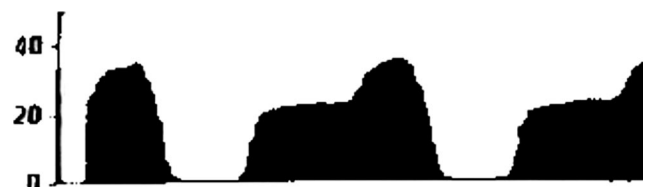
Fig. 2. An example of the capnogram after replacement of the original (modified) sample line (5.2-ml dead space) with a new standard length sample line (3.7-ml dead space). Note that the midcapnograph hump has moved to the right (shorter transit time) of the capnograph tracing.

The measurement of end-tidal carbon dioxide is a fundamental component of patient monitoring during anesthesia. Any abnormalities must be noted, investigated, and treated accordingly. To our knowledge and subsequent review of the literature, the observed abnormal capnograph waveform (fig. 1) was unlike any previously reported. The gas analyzer in the Dräger Apollo anesthesia machine aspirates 200 ml/min ( \pm 40 ml/min) of respired gases from the elbow connector at the Y piece through the sample line and water trap for the measurement of end-tidal gas partial pressures. Biphasic, dual-plateau