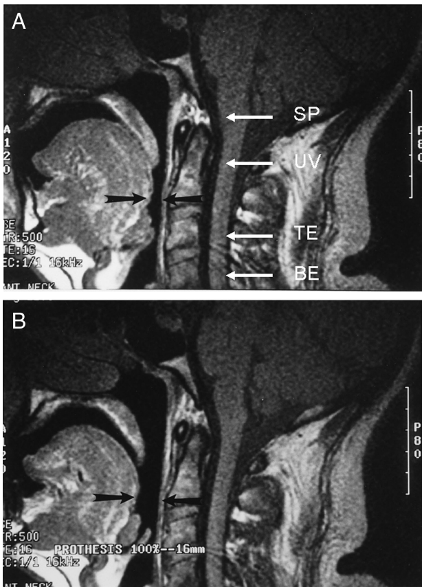
Fig. 2. Midline sagittal magnetic resonance images of the pharyngeal airway in one subject during propofol anesthesia without (A) and with maximum (B) mandibular advancement. A indicates the location of the four pharyngeal levels examined on the axial images: soft palate (SP), uvula (UV), tip of epiglottis (TE), and base of epiglottis (BE). Note the increase in pharyngeal airway size at all four pharyngeal levels with maximum advancement.

the nine subjects. In these subjects, the airway was opened by using the oral appliance to advance the mandible to 50% or maximum advancement. Once the subjects were on a maintenance dose of intravenous propo-