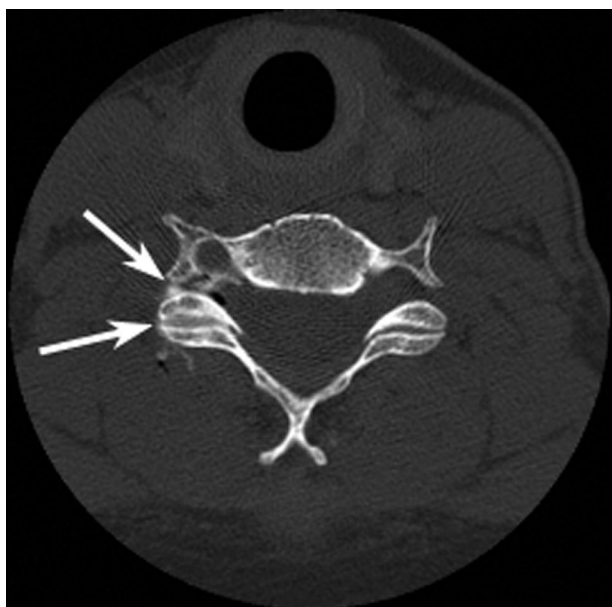
Fig. 2. Axial computed tomographic image showing spread into the right C6–C7 zygapophysial joint and foramen.

outcome measures as well. Contrast spread into the center of an intervertebral foramen was noted during two blocks (4.5%) in the 0.25 ml group versus five times (11.9%) in the 0.5 ml group ( P = 0.19 ). Only two instances of intra-artic-