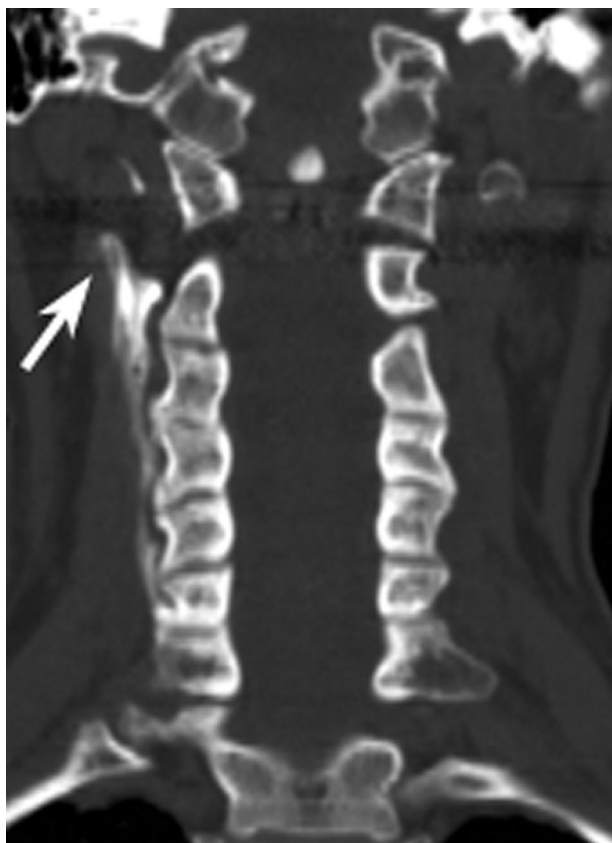
Fig. 1. Coronal reconstructed computed tomographic image demonstrating a right-sided C3–C6 medial branch block with contiguous spread to the third occipital nerve.

outcome measures as well. Contrast spread into the center of an intervertebral foramen was noted during two blocks (4.5%) in the 0.25 ml group versus five times (11.9%) in the 0.5 ml group ( P = 0.19 ). Only two instances of intra-artic-