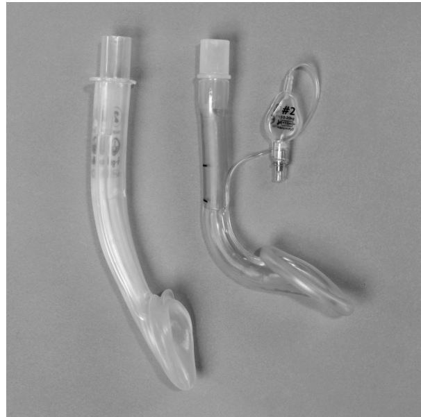
Fig. 2. Lateral view of the i-gel #2 (Intersurgical Ltd., Wokingham, Berkshire, United Kingdom) and the Ambu AuraOnce #2 (Ambu A/S, Ballerup, Denmark). The more pronounced airway angle of the Ambu AuraOnce compared with the i-gel is clearly visible.

The fiber-optic view was remarkably good through both devices, and epiglottic downfolding was rarely observed. The