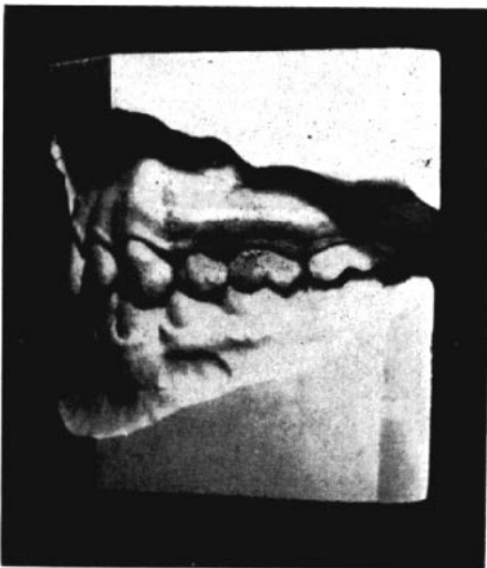
Fig. 1 Faulty axial positioning of maxillary and mandibular canines.

Exaggerated buccal axial inclination of maxillary buccal teeth, combined with exaggerated lingual axial inclination of mandibular buccal teeth or a reversed condition is apt to lead to eventual lingual occlusion of the maxillary buccal teeth or even a crossbite adjustment of the two dentures, the result of an effort to gain better functional efficiency. Exaggerated mesial tipping of buccal teeth encourages mesial shifting of buccal segments. Exaggerated distal tipping, on the other hand, is the least dangerous of failure to establish correct axial positioning. This is due to the fact that the subsequent uprighting of these teeth produces a forward pressure which is favorable in maintaining close proximal contact and holding the extraction space inviolate. When excessive, however, the eventual uprighting by the forward movement of these molar crowns may cause forward shifting of entire buccal segments, manifested