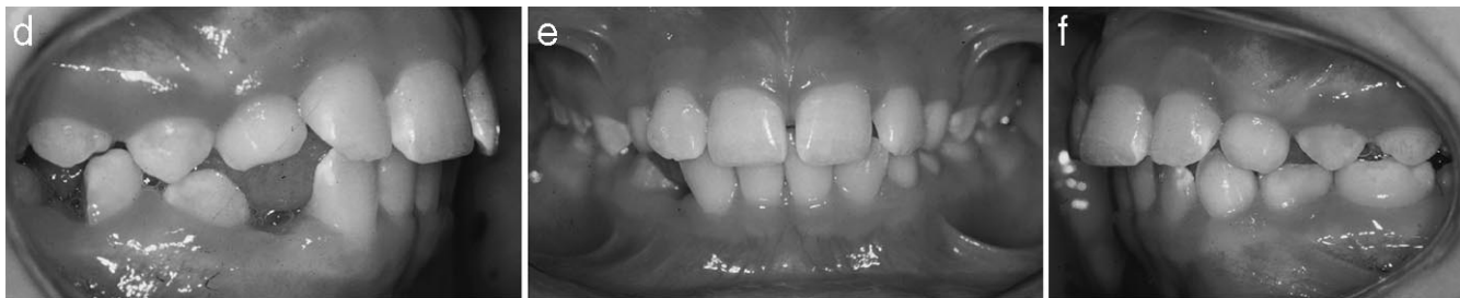
FIGURE 1. (d)–(f) Four months after unilateral hemisection. Note the midline still off 1–2 mm.

groups, all the cases treated by hemisection, but not having teeth removed in the maxilla and all the cases being treated by hemisection, but having teeth removed in the maxilla and a control. To establish what might represent a nontreated control, the Bolton templates from ages nine and 12 years were measured and included in the table in this study.