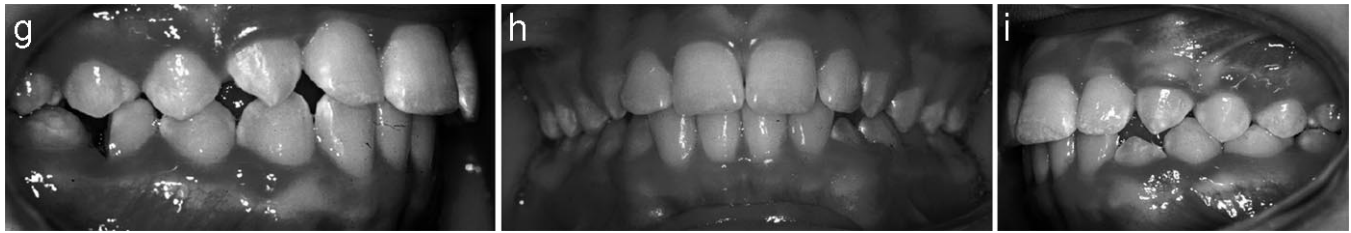
FIGURE 1. (g)–(i) Seventeen months after hemisection. Space is nearly closed and ready for removal of the mesial half; midline is still unchanged.