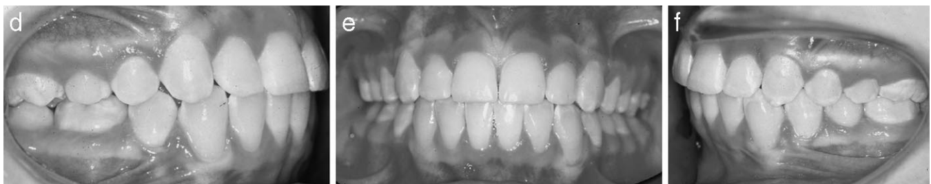
FIGURE 2. (d)–(f) Following 13 months of braces, the midline has been easily restored and spaces are closed.

The net molar corrections were statistically significant with more molar relation correction for the hemisection cases than the premolar extraction groups. There were no statistically significant differences in overjet change.