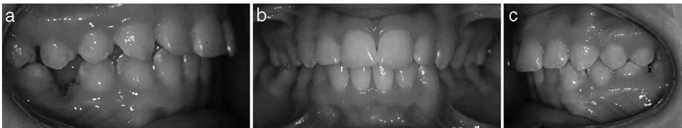
FIGURE 2. (a)–(c) Ready for fixed appliances; note that, only 8 months following the removal of the mesial “bookend,” the midline is beginning to shift toward the extraction.