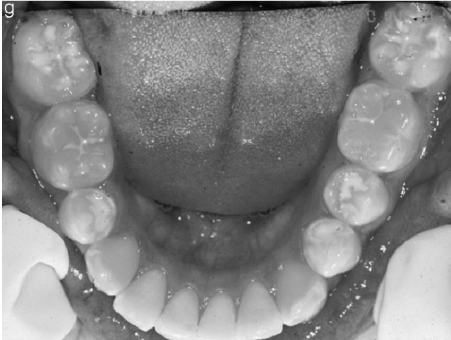
FIGURE 2. (g) Final mirror shot.

moved forward only in the hemisection group that had no upper teeth removed. The Bolton template showed a 0.2 mm retraction of the lower lip, the hemisection cases that had upper premolars removed had a 1.22-mm retraction and the premolar extraction cases experienced 2.44- and 1.61-mm retraction, respectively.