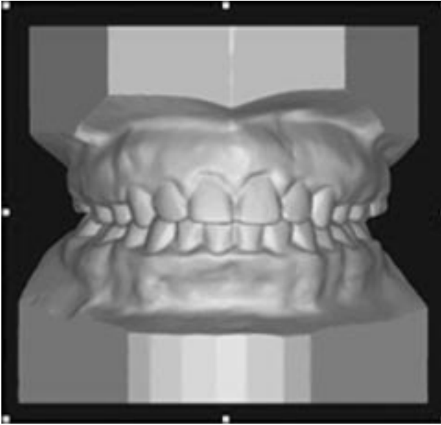
FIGURE 1. Anterior view of digital model (emodel by Geodigm™ Corporation).

plaster and digital model linear measurements but concluded that the average difference was clinically insignificant. Tomassetti et al 5 carried out Bolton analyses on 21 conventional plaster study cast sets using a vernier caliper and found no statistically significant difference in measurement outcomes between the plaster and the digital study models.