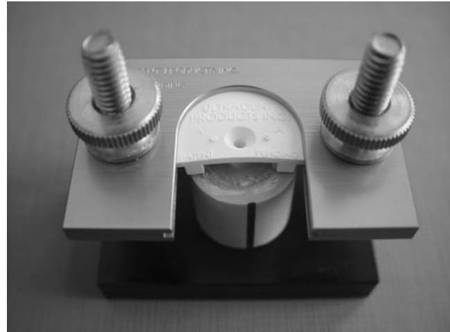
FIGURE 1. Application apparatus of orthodontic composite on the enamel surface.

• Group 1, control group—no antibacterial mouthwash solution was used. A 37% orthophosphoric acid gel (3M