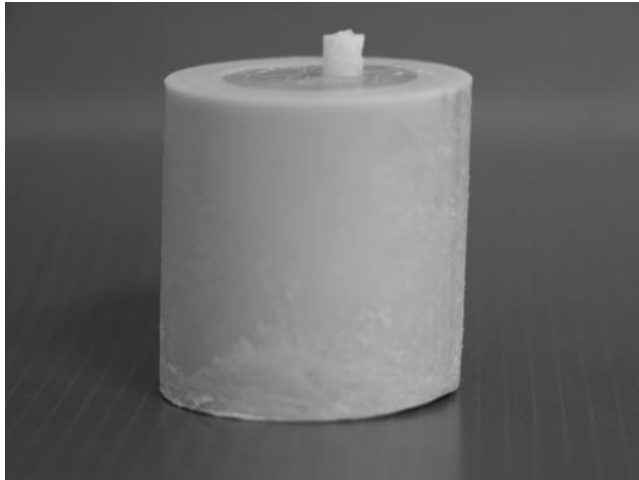
FIGURE 2. Orthodontic composite block over enamel.