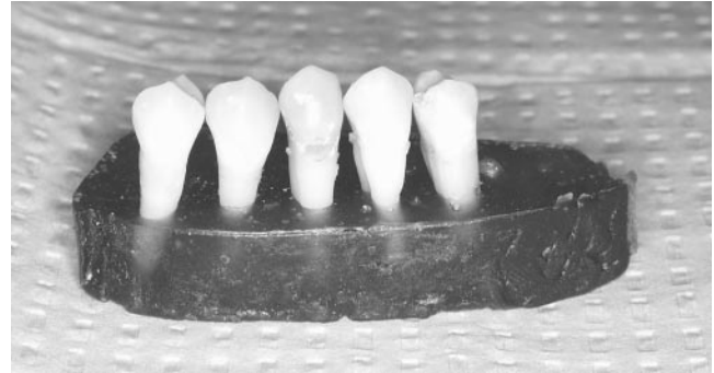
FIGURE 1. Indirect-bonding sample preparation after acrylic application.

Before bonding the indirect samples, groups of five teeth were attached to a 0.040-inch stainless steel wire with sticky wax so that the interproximal surfaces