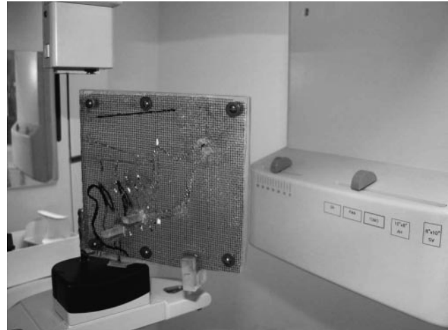
FIGURE 1. The phantom was set up in the panoramic machine using a custom positioner that was representative of an average mandibular position in the machine.

A phantom was constructed of 8-mm thick Plexiglas and was used to simulate selected anatomical features in one-half of the human mandible using average measurements obtained from a sample of adult skulls.