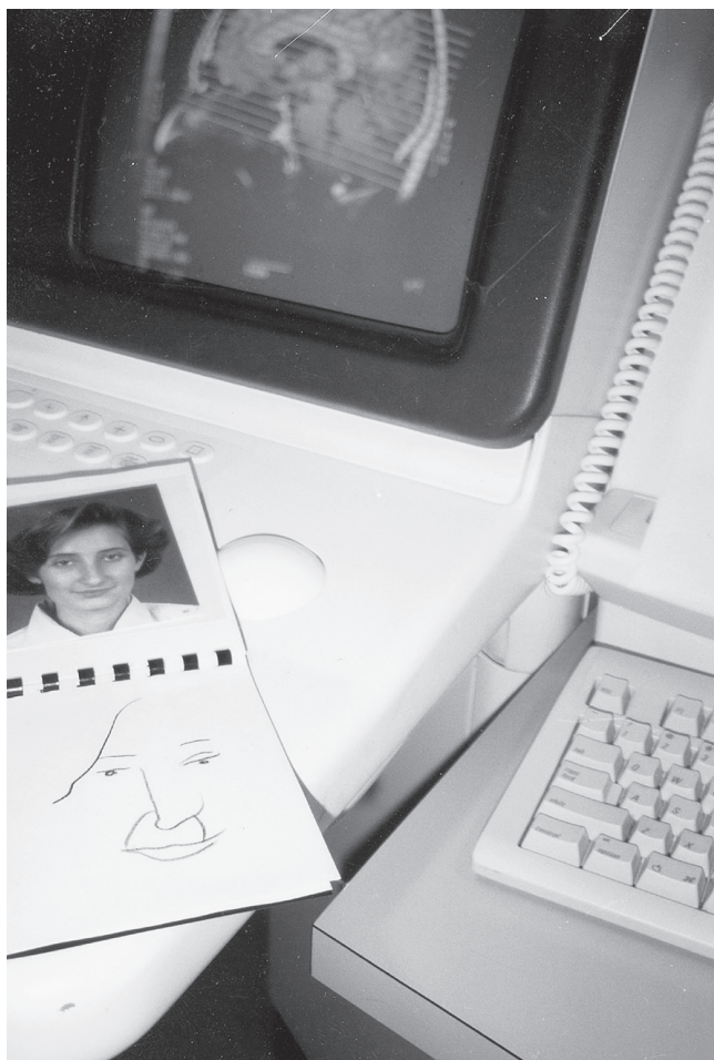
Fig. 2. Photograph showing sketch made by Humphrey Ocean during fMRI measurement and the computer set-up. (Sketch © Humphrey Ocean.)

Before the main experiment was conducted, a feasibility study was undertaken in which I performed a facial