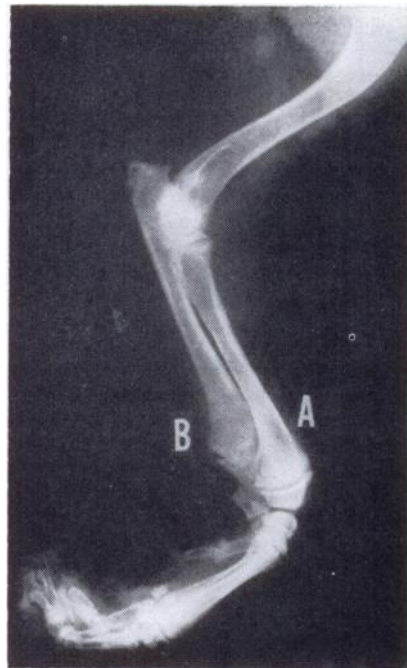
FIGURE 1. Lateral radiograph of the right forelimb. Notice the thinning of the distal cortices of the radius (A) and ulna (B) and the transverse widening of the metaphyses at the epiphyseal line. There is suggestive lipping of the margins of the metaphyses.

varied from dull-pink to dull-gray. Most kits were affected with a mild bilateral conjunctivitis. Facial enlargement was not encountered in any of the kits. There were palpable bilateral enlargements of the distal epiphyses of the radius and ulna, the distal epiphyses of the femur, and the costochondral junctions of the ribs. The radius and ulna were slightly bowed posteriorly. Most of the kits had