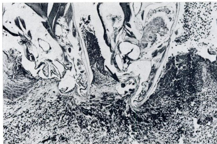
FIGURE 4. Oral mucosa: Part of Fig. 3 showing mandible of louse deeply imbedded in submucosa (arrow), and submucosal hemorrhage and cellular infiltration. Hematoxylin-eosin. x 110.