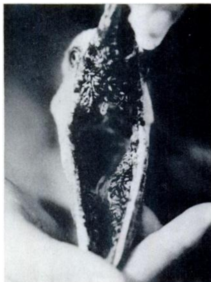
FIGURE 1. Massive infestation of Piagetrella peralis in the oral cavity of a live juvenile white pelican.

palate about the internal nares. Adult and juvenile lice were also attached at other sites in the pouch. The tissue surrounding the concentrations of lice was covered with a tenacious brown exudate which appeared to be a mixture of blood and louse excrement. Lice were firmly attached to the mucosa, and when detached, the underlying mucosa was ulcerated and hemorrhagic.