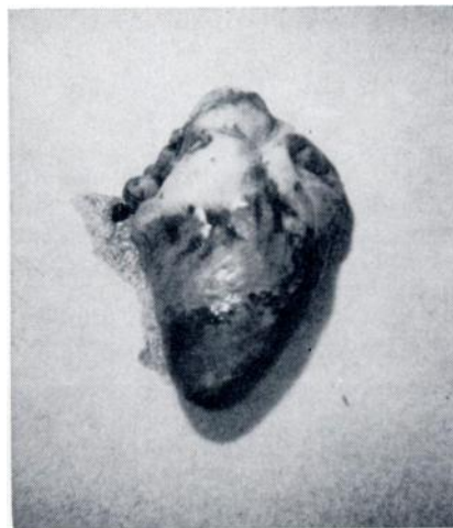
FIGURE 4. Duck virus enteritis (duck plague) in a black duck. Hemorrhages in the heart.