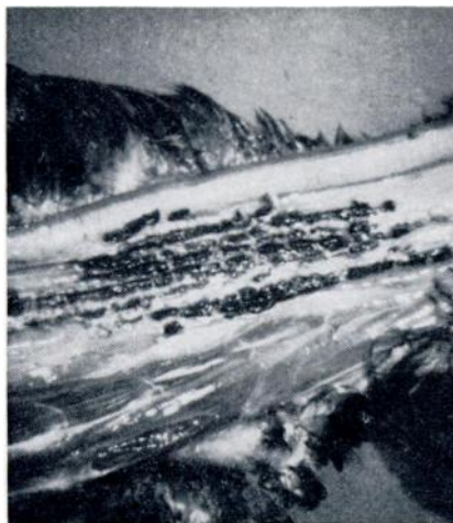
FIGURE 2. Duck virus enteritis (duck plague) in a black duck. Fibro-necrotic plaques in the esophagus.