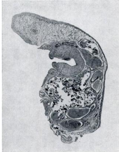
FIGURE 1. Section of adult trematode taken from the round window of the cochlea of a dolphin (X35).

tory system and acoustic behavior of dolphins and whales should be aware of the possibility that parasites could contribute to loss of hearing and thus affect the accuracy of accumulated data.