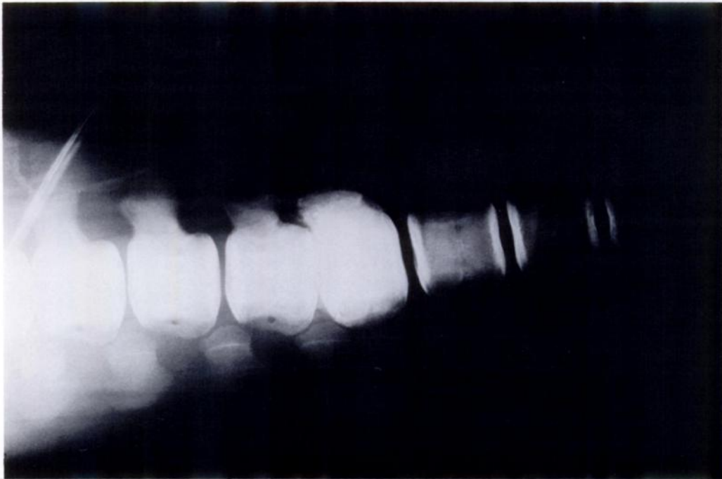
FIGURE 3. Radiograph of the posterior lumbar spine of an Atlantic bottlenose dolphin 4 mo posttreatment. Although the disk space has remained collapsed there has been no further extension of the disease process as compared to Figure 2.