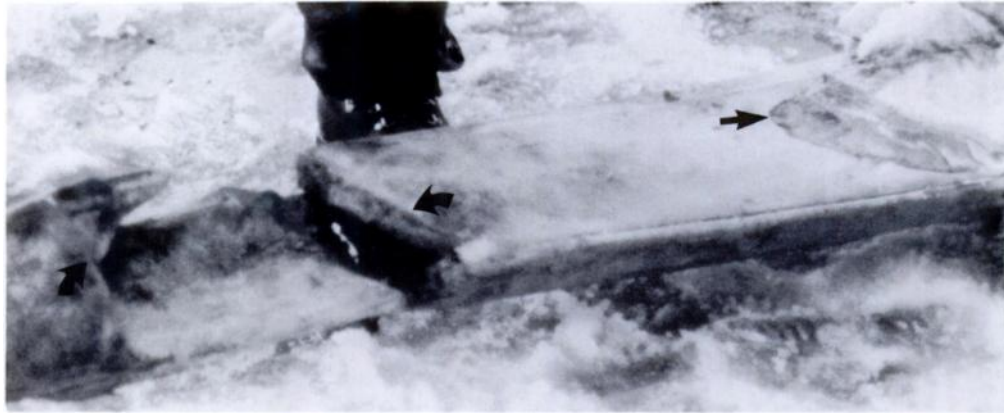
FIGURE 1. Proximal (to the right) and distal (to the left) fragments of fractured right mandible of a female bowhead whale, shown after all overlying tissue had been removed. Curved arrows indicate fracture site, which has been separated by approximately 0.5 m. Straight arrow on proximal fragment indicates demarcation between devitalized tissue (to the left) and apparently healthy tissue (to the right). Note the absence of a callus.

and 25 cm wide in the center, was fractured approximately midlength. The broken ends were not overriding. The bone was gray, apparently necrotic and free of periosteum for approximately 1 m cranial and caudal to the fracture site (Fig. 1). The 1 to 3 cm tissue layer immediately overlying this 2 m of bone was necrotic and stripped easily from the bone. There were two foramina clearly visible on the medial aspect of the proximal mandibular fragment (Fig. 2). One was approximately 0.5 m caudal to the fracture, the second