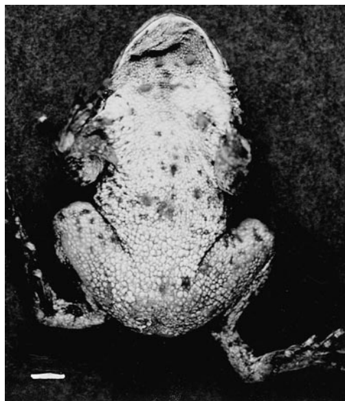
FIGURE 1. Ventral view of a Wyoming toad that died from mucormycotic dermatitis with multiple, small (2 mm), raised hyperemic nodules with white fuzzy caps. Bar = 5 mm.

All toads were observed eating on a regular basis and approximately 3 to 10 days after hibernation emergence, all toads were hormonally induced to breed. This was achieved by subcutaneous injection of 1 µg/10 g body weight luteinizing hormone releasing hormone (HRH 4513; Sigma Chemical, St. Louis, Missouri, USA). Toads were then paired and each pair was placed in their own breeding tank. These tanks were identical to those described above, except they were flooded with water to a depth of 5 to 8 cm. Within 8 to 36 hr, the toads were calling and in amplexus. Four toads developed clinical signs of disease after being in amplexus for at least 36 hr. These signs included lethargy and multiple (4 to 12) small (2 mm) raised hyperemic nodules with white fuzzy caps on the ventral skin (Fig. 1). The condition progressively worsened until death occurred, within 6 days.