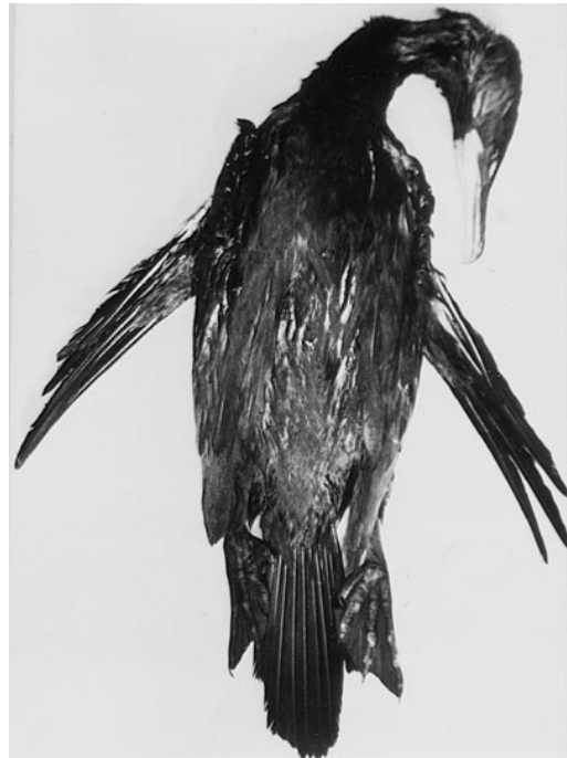
FIGURE 1. Dorsal view of a 10-wk-old double-crested cormorant with bilateral 90° rotation of the carpal joint. The primary feathers are held at a 30 to 45° angle to the median plane, with the undersurface facing up.

Abnormal rotation of the carpal joint was observed in at least five post-nestling chicks from 6 to 12 wk of age. The abnormality affected the left ( n = 2 ), the right ( n = 2 ), or both wings ( n = 1 ). All affected birds were in good body condition. In resting position, the primary feathers of the affected wing were held horizontal at a 30 to 45° angle to the median plane, with the undersurface of the primary feathers facing upward (Fig. 1). The elbow of the affected wing was held slightly higher than normal and on the contralateral side of the median plane. When the wing was spread, the carpal joint could not be extended more than about 90 to 135°. In the water, the primary feathers of the affected wing dragged through the water and slowed down the bird's progress. The bilaterally affected bird was observed diving, but it was slower than normal, water weeds caught in its wings, and it did not stay under water for longer than about 5 sec. A necropsy was carried out on this bird, a male in good body condition. In resting position of the wing, the right carpal joint was rotated 90° in a clock-wise direction, and the left carpal joint was rotated 90° in a counter-clock-wise direction. Other joints appeared normal.