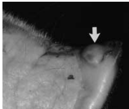
FIGURE 4. Typical lesions of snout in experimental swine infected with calicivirus FADDL 7005 (arrow).