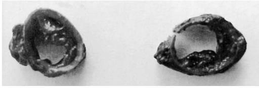
FIGURE 1. Cross sections of trachea from skua carcasses demonstrating thick, nodular, intraluminal Thelebolus microsporus mycelial mats admixed with sloughed necrotic mucosa.