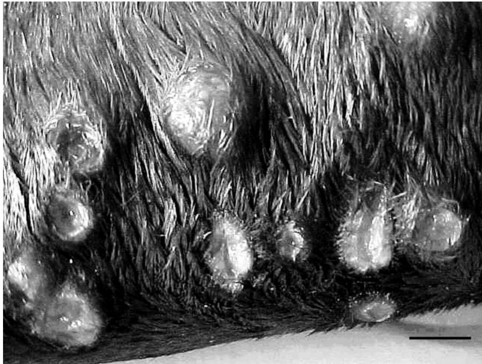
FIGURE 1. Gross appearance of pox lesions. Approximately 1 cm diameter raised smooth, hairless often umbilicated nodules were scattered across the body. Scale bar=1 cm.

cerated lesions on the fore-flippers (Fig. 1). This pup was not branded, so resight data were not available. Histologically, there were masses within the dermis composed of broad cords of large, polygonal epithelial cells. The cells had sharply delineated cytoplasmic borders, and a moderate amount of lightly basophilic cytoplasm. Nuclei were consistent in size and were round to oval with one or two prominent nucleoli/nucleus, fine granular chromatin, and 0–4 mitotic figures/high-power field. Some nuclei contained one or two clear vacuoles. Many of these epithelial cells contained a single large brightly eosinophilic inclusion body (Fig. 2). The centers of the epithelial cords were necrotic and occasionally mineralized. Scattered lymphocytes, plasma cells, and neutrophils were present in the dermis surrounding the mass. The epithelium overlying the masses was intact and did not contact the mass in sections examined.