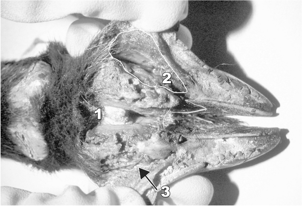
FIGURE 2. Anterior foot of a male ibex with interdigital exudative dermatitis (1), sole ulcer (2) and detachment of the horn of the wall (white line, 3). The sole ulcer was covered by an overgrowth of horn of the bearing border (removed to reveal the ulcer).

Therefore, it was not possible to study benign or intermediate forms of infection or feet from healthy wild animals, which could serve as negative controls. However, the pathological lesions observed in addition to our PCR results are compatible with the hypothesis that D. nodosus causes foot rot in free-ranging ibex and mouflon.