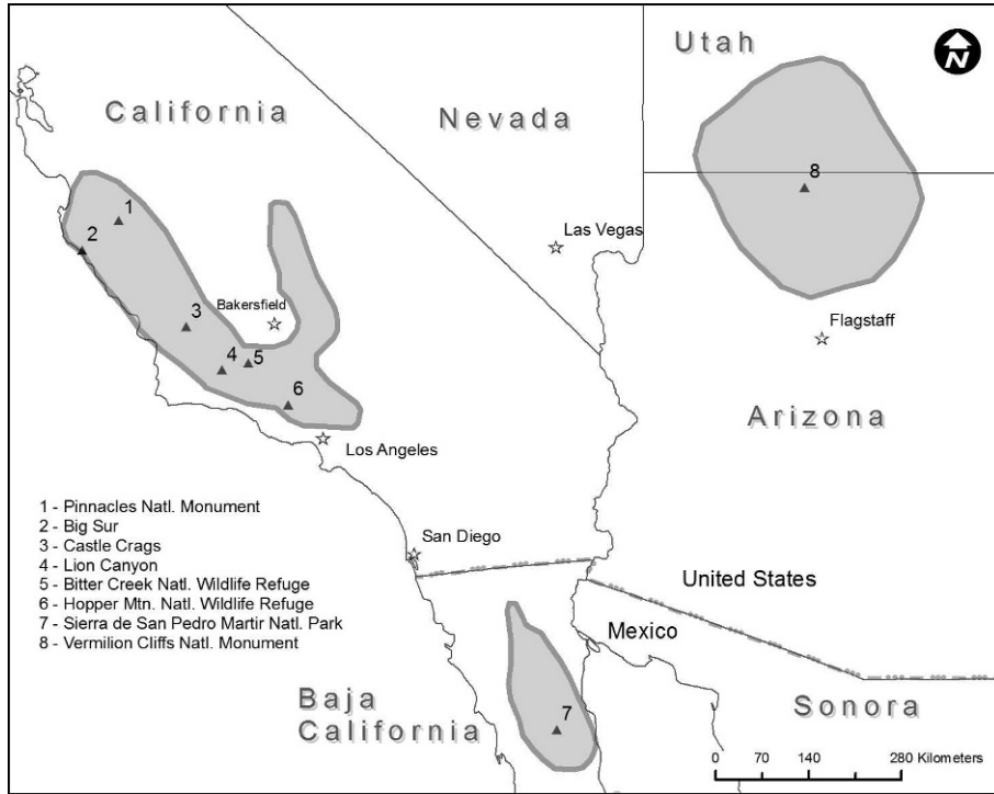
FIGURE 1. Map of California Condor release locations (numbered 1–8) and current range (shaded) in the southwestern United States and northwestern Mexico.

1978; Janssen et al., 1986; Wiemeyer et al., 1988) but their relative importance was not fully known.