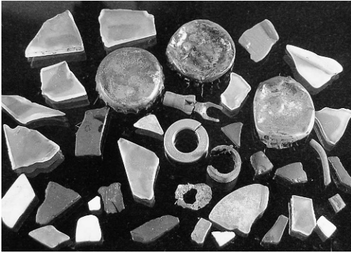
FIGURE 2. Gizzard content from condor 285. The presumed source of zinc toxicosis was the galvanized split-metal washer at center.

considered the primary factors. Four birds were killed by gunshot and another by arrow. One of the gunshot birds died of idiopathic interstitial pneumonia while being treated for a severe, open, comminuted fracture of the distal right tarsometatarsus caused by the gunshot. One additional bird had evidence of nonfatal gunshot, with shotgun pellets embedded in the body and one wing. The only confirmed infectious disease was a West Nile virus infection, complicated by secondary respiratory aspergillosis, that was the cause of death in one subadult (450) that had been vaccinated against West Nile virus (see Chang et al., 2007). Two females had ingested a variety of small trash items (see Table 2), including zinc-core pennies, which led to secondary zinc toxicosis as the immediate cause of death. Nine birds, three of them nestlings, had hepatic copper concentrations more than four standard deviations above the mean for the captive flock, but none had lesions suggestive of copper toxicosis (e.g., inanition and bile stasis in the liver). Two of them had ingested metallic trash. One bird (260) had evidence of zinc exposure but with no ingested foreign bodies present at necropsy.