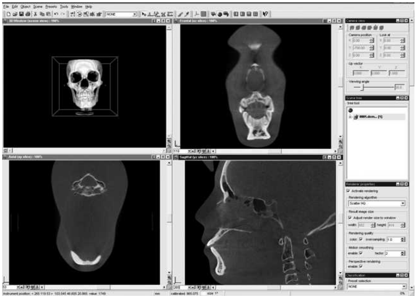
Figure 1. With the software used, a suitable slice can be freely selected for landmark plotting on sectional images in each of three directions ( X_i , Y_i , and Z_i directions). When a landmark is identified on a slice image, it can be marked automatically on two other slice images.

familiar with them and can compare 3D analytic results with large amounts of 2D data that have been accumulated.