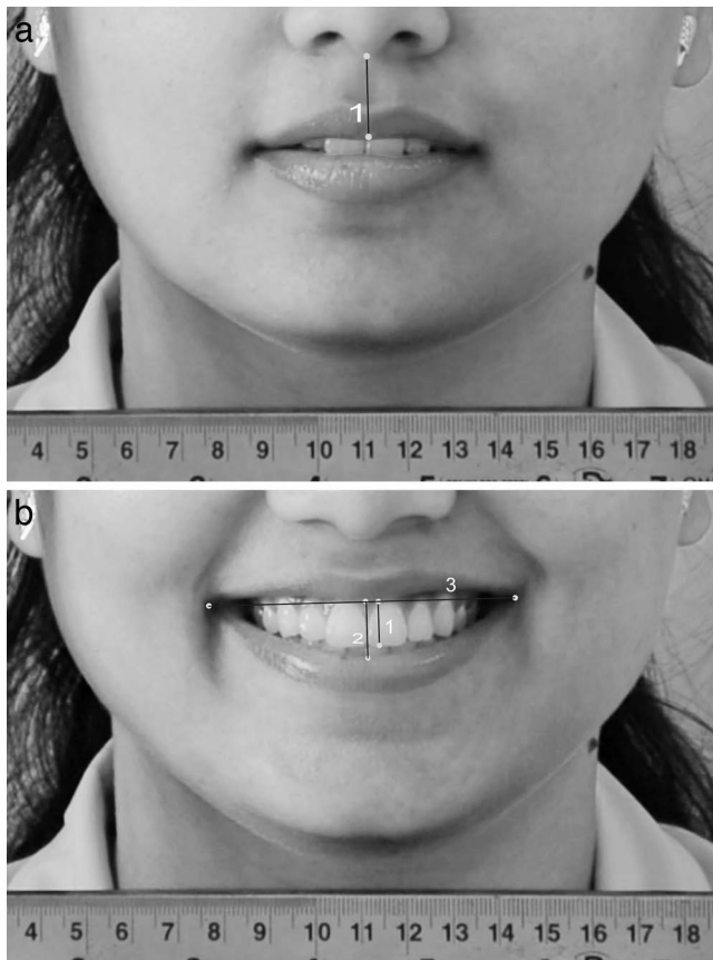
Figure 3. (a) Measurement taken at rest: upper lip length at rest. (b) Measurements taken at smile photograph: (1) maxillary incisal display, (2) interlabial gap, (3) outer intercommissural width.

with vertical skeletal and dental height. The results of our study were comparable with the findings of Blanchette et al. 17 , Lai et al. 18 , and Feres et al., 19 who reported in their cephalometric studies that dolichofacial individuals have longer lips, whereas brachyfacials have shorter lips. They stated that in dolichofacial individuals, soft tissue follows the underlying skeletal development and tries to compensate for lip seal difficulties because these individuals are more prone than others to develop lip incompetence. ULL is one of the important factors that determine the amount of maxillary incisor and gingival exposure during speech and smiling. 20,21 Short ULL has been considered a suspect in producing gingival smile line, and controversial data exist in the literature regarding this. Although Peck et al. 4 found no difference in ULL between the gingival smile group and reference groups, Miron et al. 22 observed short ULL in participants with a high smile line. In the present study, it was revealed that ULL at rest was not responsible for increased incisal exposure during smile.