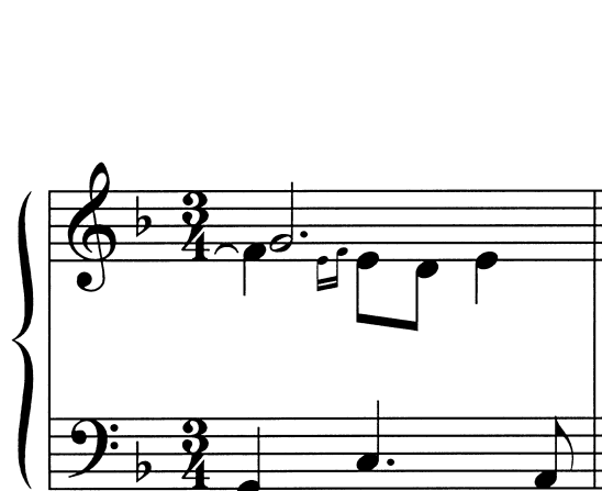
(c) m. 8

ANote 13736 14309 43 410000 ANote 13737 15368 67 410000 ANote 14086 14119 64 410111 ANote 14112 14265 65 410112 ANote 14255 15082 48 411000 ANote 14270 14529 64 411000 ANote 14531 14824 62 411100 ANote 14789 15327 64 412000 ANote 15071 15311 45 412100