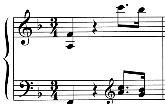
(a) m. 12

ANote 20094 20411 65 61000 ANote 20106 20430 57 61000 ANote 20115 20430 41 61000 ANote 21277 21683 84 61200 ANote 21281 21658 69 61200 ANote 21289 21662 72 61200 ANote 21676 21843 67 61211 ANote 21683 21783 70 61211 ANote 21684 21829 82 61211