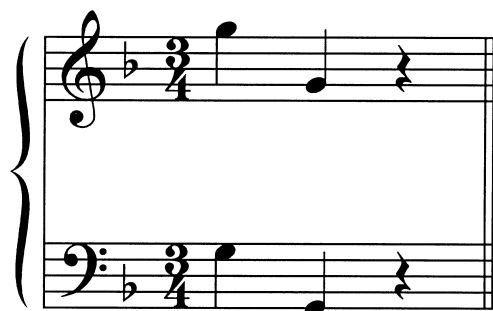
(b) m. 40

ANote 62872 63097 79 201000 ANote 62901 63136 55 201000 ANote 63450 63748 43 201110 ANote 63453 63747 67 201110