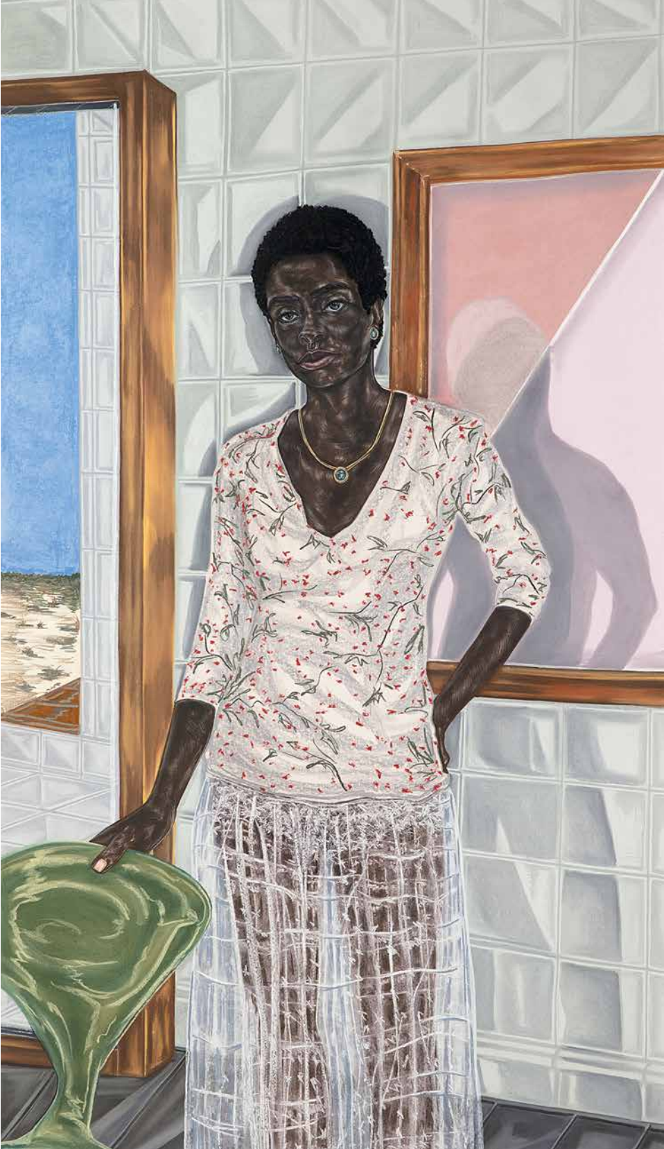
Figure 4 Pregnant , 2017. Charcoal, pastel, and pencil on paper, 74½ × 42 in. © Toyin Ojih Odutola. Courtesy the artist and Jack Shainman Gallery, New York.