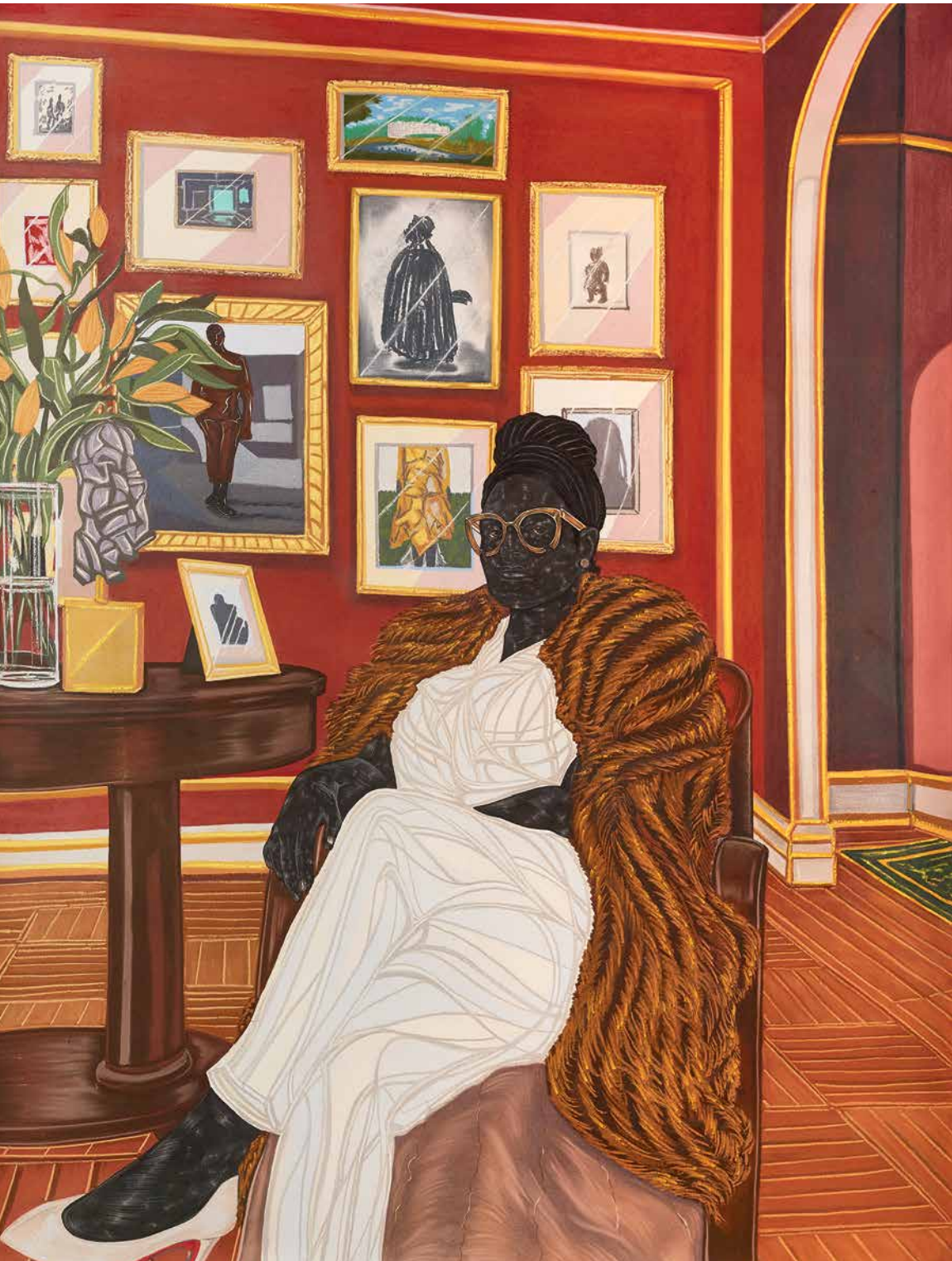
Figure 2 The Marchioness , 2016. Charcoal, pastel, and pencil on paper, 77½ × 50½ in. © Toyin Ojih Odutola. Courtesy of the artist and Jack Shainman Gallery, New York.