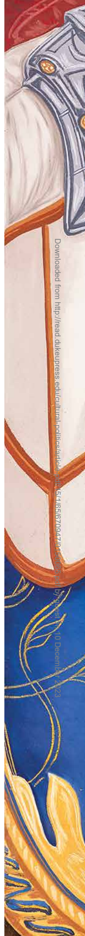
Figure 7 A Misunderstanding with the Mistress , 2016. Charcoal, pastel, and pencil on paper, 79½ × 60 in. © Toyin Ojih Odutola. Courtesy of the artist and Jack Shainman Gallery, New York.

Downloaded from http://read.dukeupress.edu/cultural-politics/article-pdf/15/1/65/16770272/150075.pdf by guest on 10 December 2023